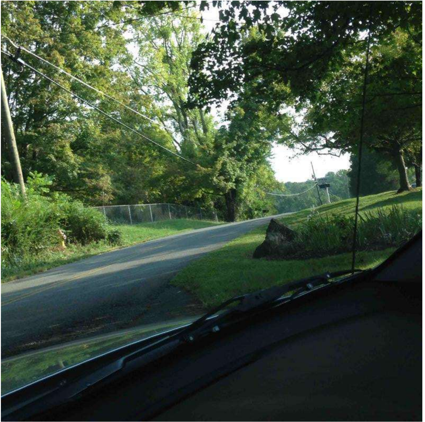
below,photo 2 showing current construction on Fort Sumpter road