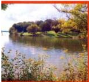
View from property toward Admiral Farragut Park

on the Tennessee River by appointment 865-740-4233