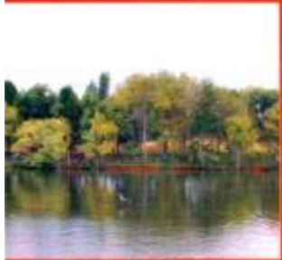
View of the property from Admiral Farragut Park

If this approach to living appeals to you, please call 865-740-4233 for a private showing.