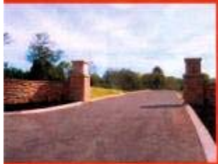
Front entrance, stacked stone with iron entry gates