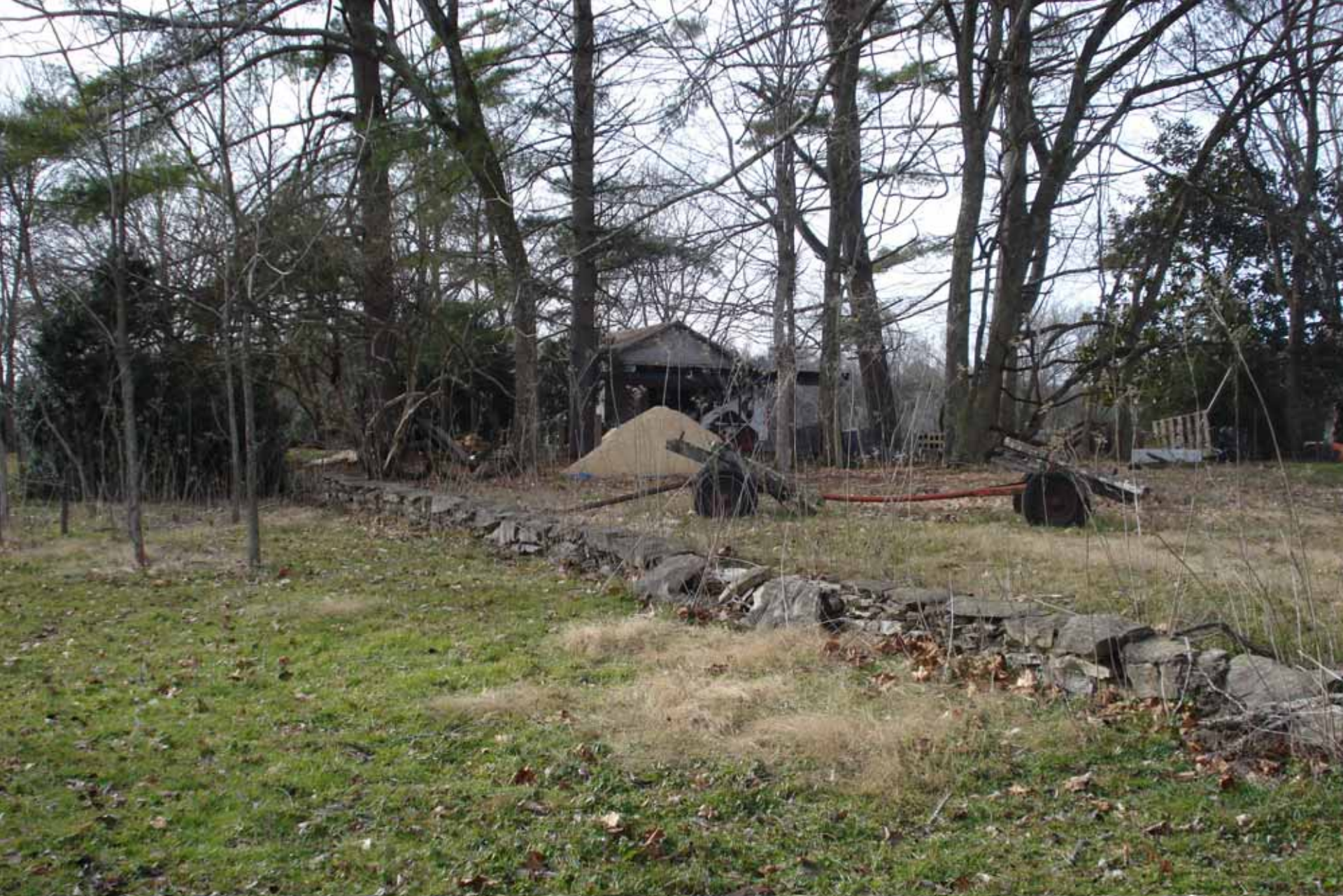
Part of a rubble wall that separates private & public land