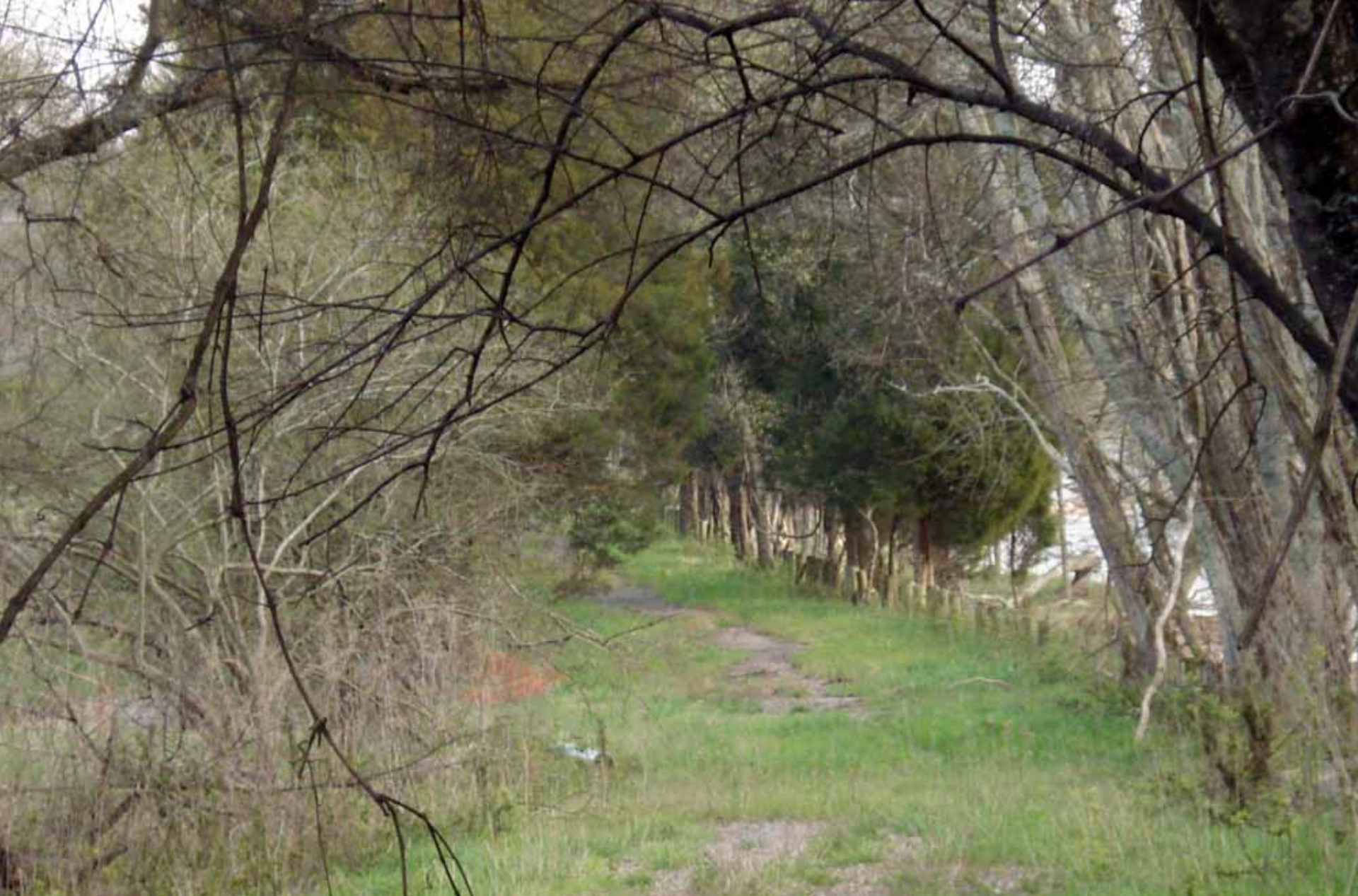
Telephoto view of 213-year old road to the ferry