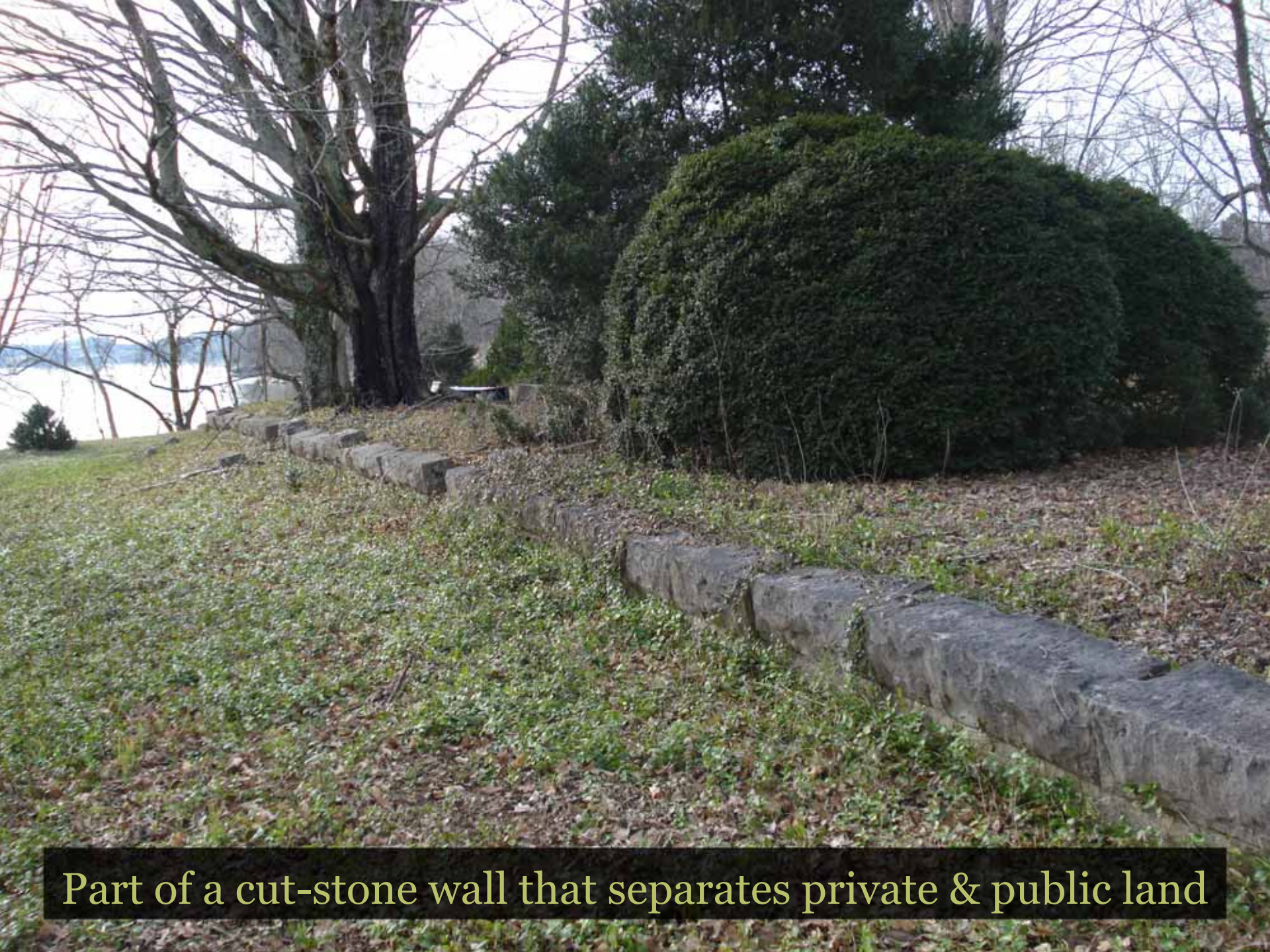
Part of a cut-stone wall that separates private & public land