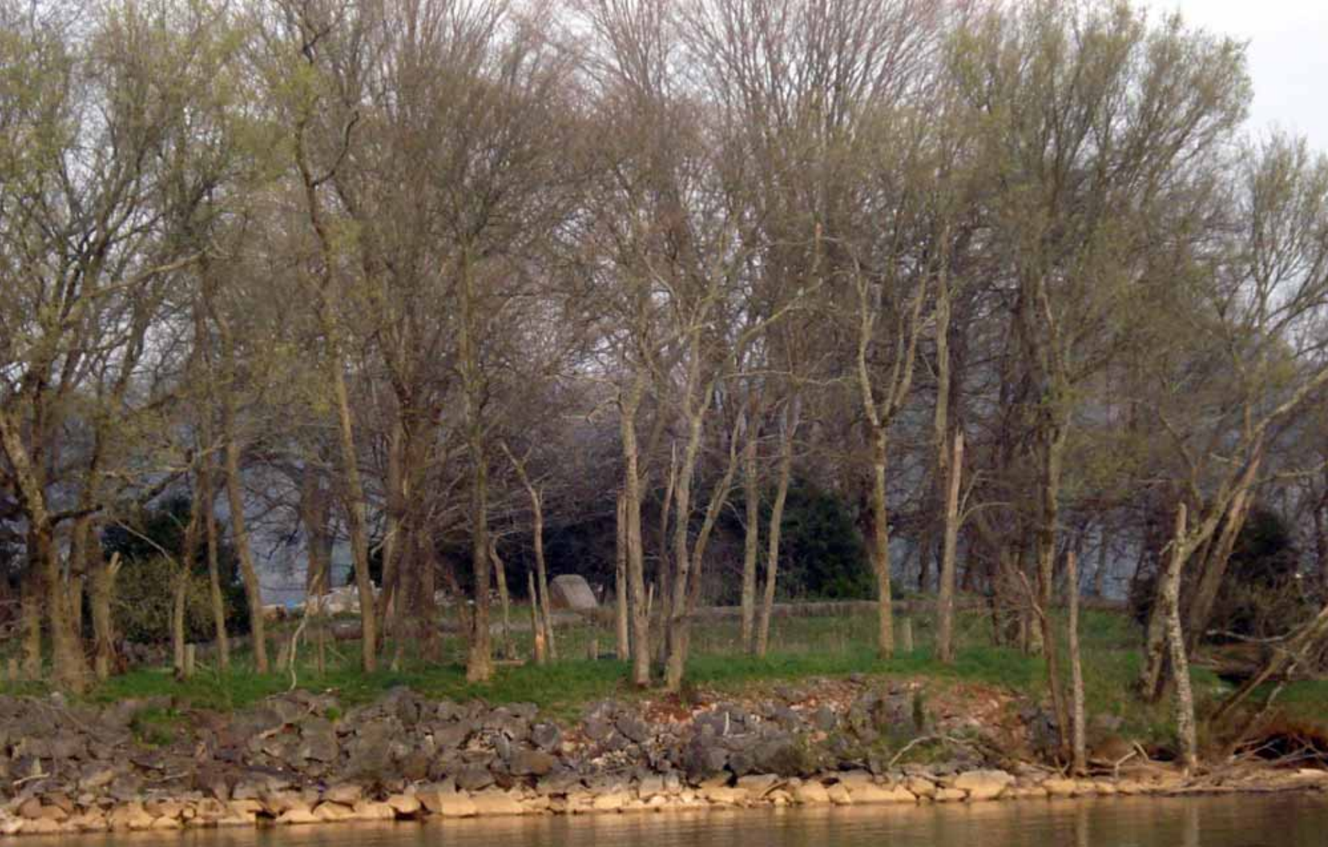
Telephoto shot showing the monument and the historic wall