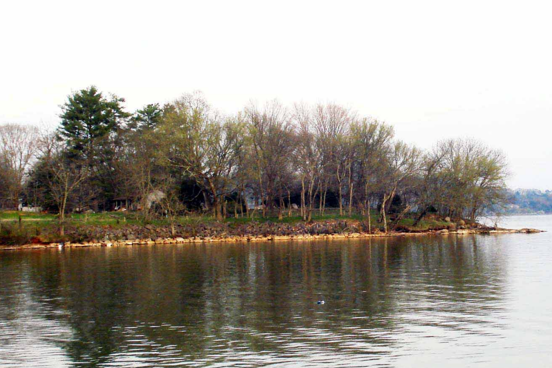
View of the landing from across the cove